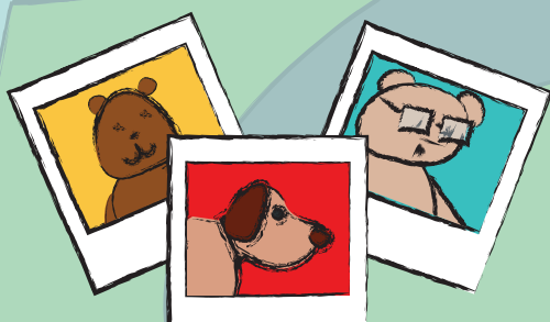
Family and Pet Photos