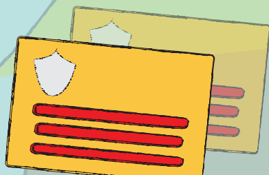
Social Security Cards